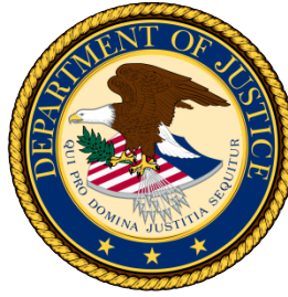
KRISTA BLAKENEY-MITCHELL Office of Victims of Crime